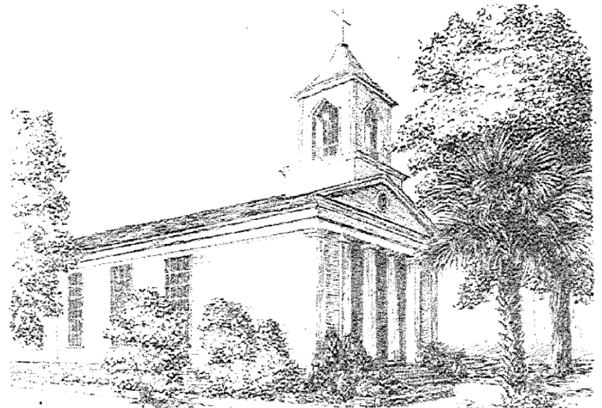
Trinity Episcopal Church (Est. 1836 - Built 1878) Apalachicola, Fla.

Welcome! We are glad to have you worship with us today. Trinity is a parish of the Diocese of the Central Gulf Coast. Chartered in 1836, Trinity Episcopal Church is Apalachicola’s historic “first church.” Services have been held here for almost 180 years. It is with great joy that we thank God for our blessings and for the beauty of this place.