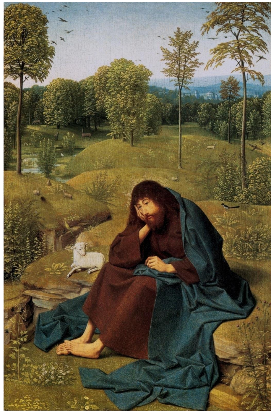
John the Baptist in the Wilderness (Geertgen tot Sint Jans (c. 1465 – c. 1495), also known as Geertgen van Haarlem)