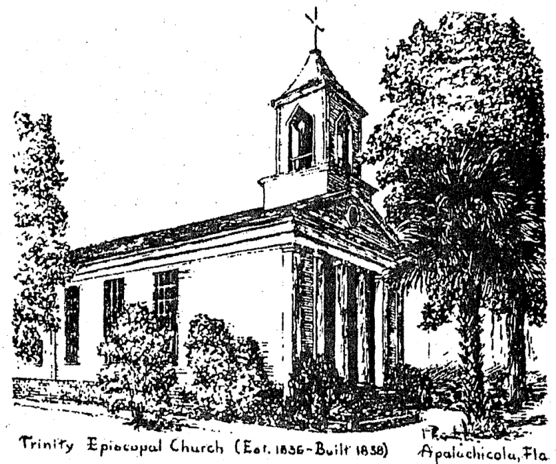
Trinity Episcopal Church (Est. 1836-Built 1838)