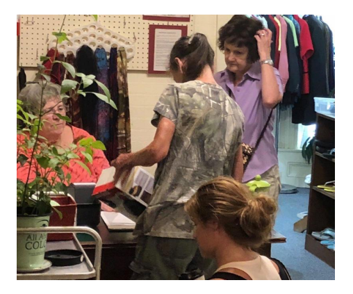
Penny's Worth Hours: Tuesday & Wednesday 10am-4pm Saturday 10am-3pm