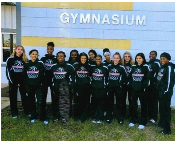
2018 Franklin County High School Girls Basketball Team.