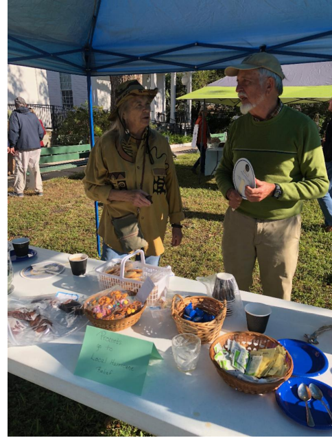
Seafood Festival visitors enjoyed Trinity Market's Coffee & Snack Stand on their way to the parade. Many also left with baked goods and hand-made items.