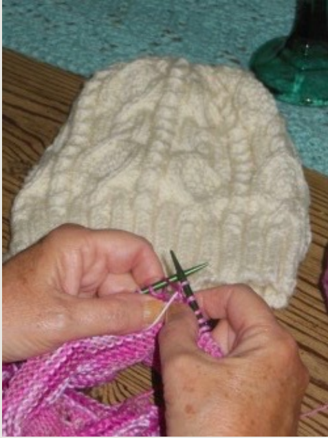
Connie Finneran is already busy creating caps, headbands, and other knitted items for the upcoming Trinity Market.

your creative hats and share your talents!